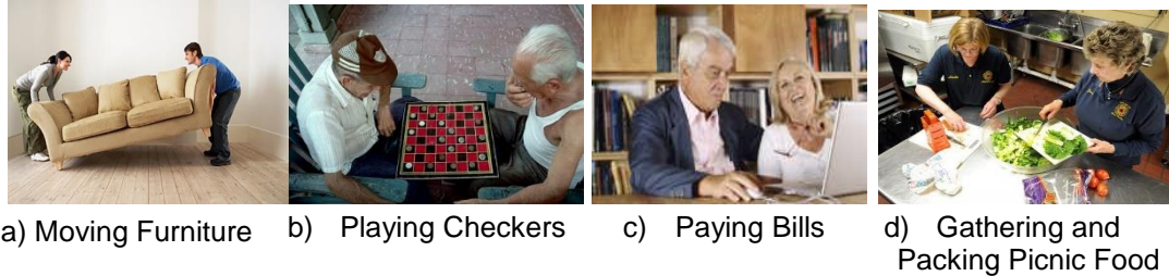
Figure 3. Examples of Cooperative Activity of Multi Resident in Smart Home

home. The interaction between the resident can occur in term of cooperative activity. The cooperative activity only happens whenever there are multi resident in the same environment and the sensor signal at the same location. Figure 3 illustrates examples of cooperative activity in multi resident environment.