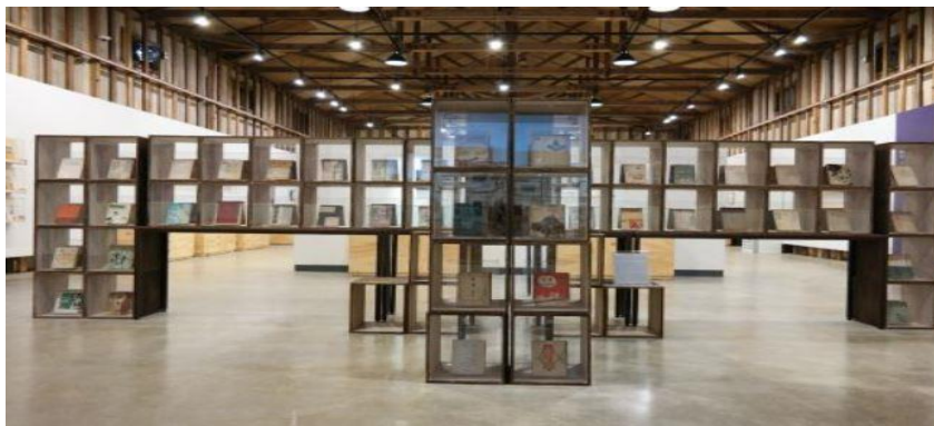
Figure 4. The Book Museum

Without books, it is almost impossible to talk about cultural contents. There is a book museum in the village. It classifies books into various categories thematically, chronically, and country-specifically. The old textbooks, antique books, and children's books can be found in the museum as seen in Figure 4. It aims to connect people through books and remind grown-ups of old memories.