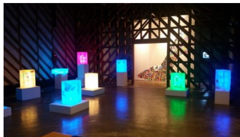
Figure 2. The VM Gallery

As seen on Figure 2, the VM Gallery embraces both media art and traditional art simultaneously by adopting the most updated media technologies. The gallery regularly holds exhibitions. What is unique about the village is that there is an old-fashioned building used for seminars and lectures. The building established during the Japanese colonial period used to be residential space for a long time. It was reconstructed, reviving authentic beauty of the exterior. Visitors can not only enjoy art but also take a rest and enjoy delicious foods at the culture cafe in the village. It is operated outside in summer, rearranging an outdoor deck as seen in Figure 3.