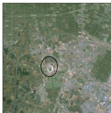
Figure 1. Samlye and Its Neighboring Regions

Landlord-based development is a case in which landlord community plays a leading role in local development projects, gathering investors or investing on their own, establishing a regeneration plan on their lands, and cooperating with the local government in terms of administrative policy. Samlye is a good example for urban regeneration to satisfy the above condition; its sense of place as well as infrastructures is as follows.